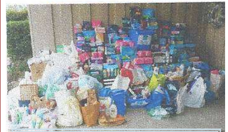
Items collected in 2019

See page 7 for information on Buckles & Bows 4th annual Blue Box Project .