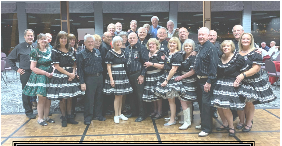
Our group in Laughlin, Nevada, at the Holiday Hop