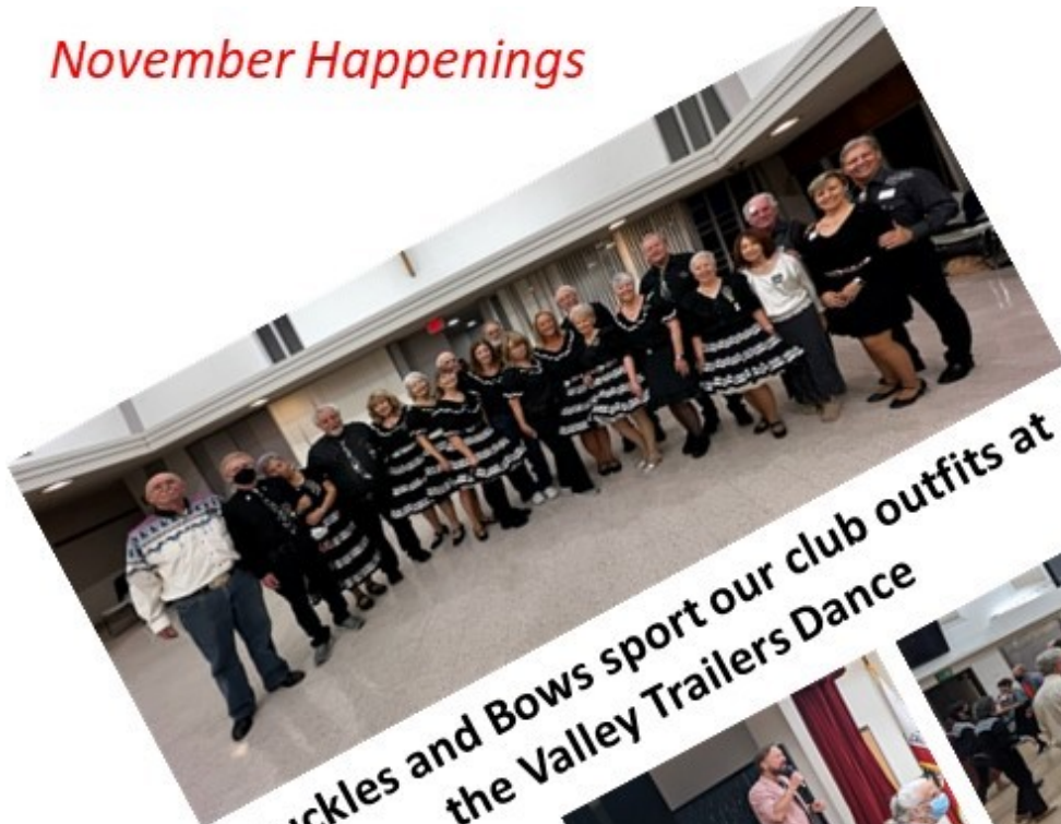
Buckles and Bows sport our club outfits at the Valley Trailers Dance