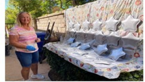
Shining Star Holiday Party Decorations Production