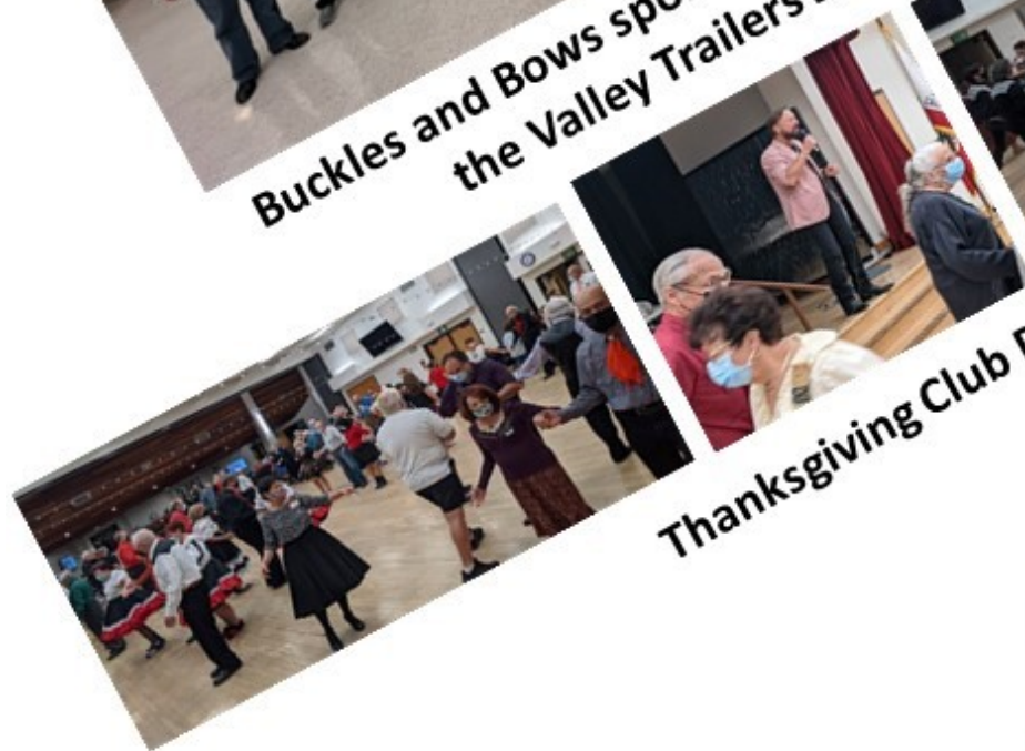
Thanksgiving Club Dance