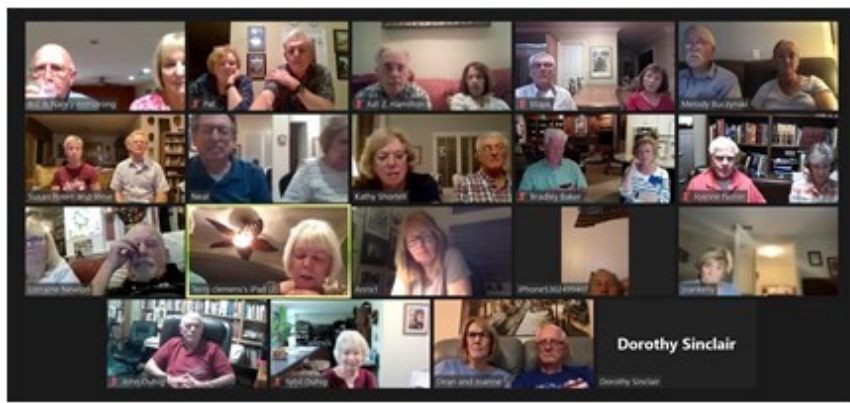
Board Meeting on ZOOM Topics: January start of class for new dancers, Holiday Party, Club Dances