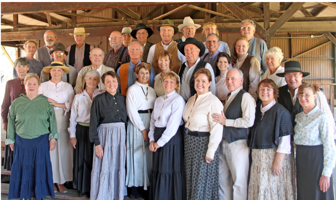
These members of Buckles & Bows were involved with the movie "Boonville Redemption" with Pat Boone See anyone you recognize?